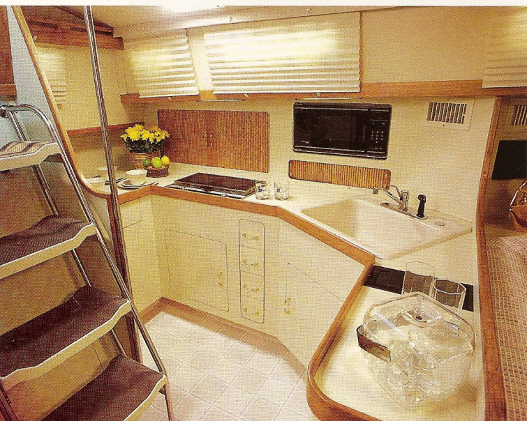
The modern galley with counter-top stove, microwave, and enameled sink.