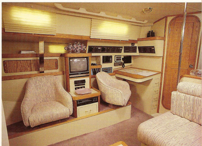
Comfortable swivel chairs, entertainment center, and navigation station.

Welcome aboard the Pearson 37, a sailboat that represents a whole new level of comfort and cruising performance. Here is a boat that is a total delight to sail with a group of friends or with just two people, thanks to her fully-battened mainsail, self-tacking, roller furling jib, and cockpit-led sail controls. But one look at the interior tells you this is not even half the story.