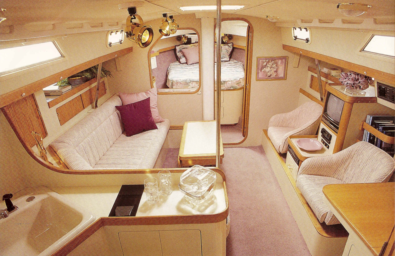
The interior of the Pearson 37 looking forward from the companionway.