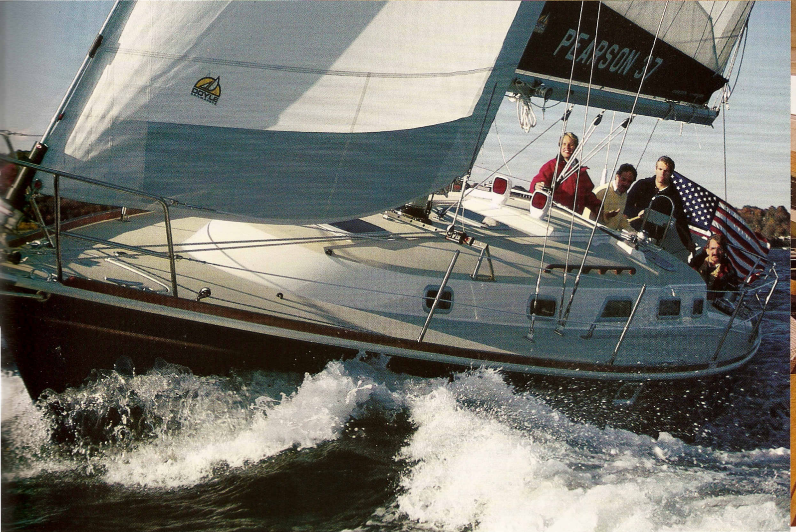
The Pearson 37 under sail is easily driven with her self-tacking jib and fully-battened mainsail.