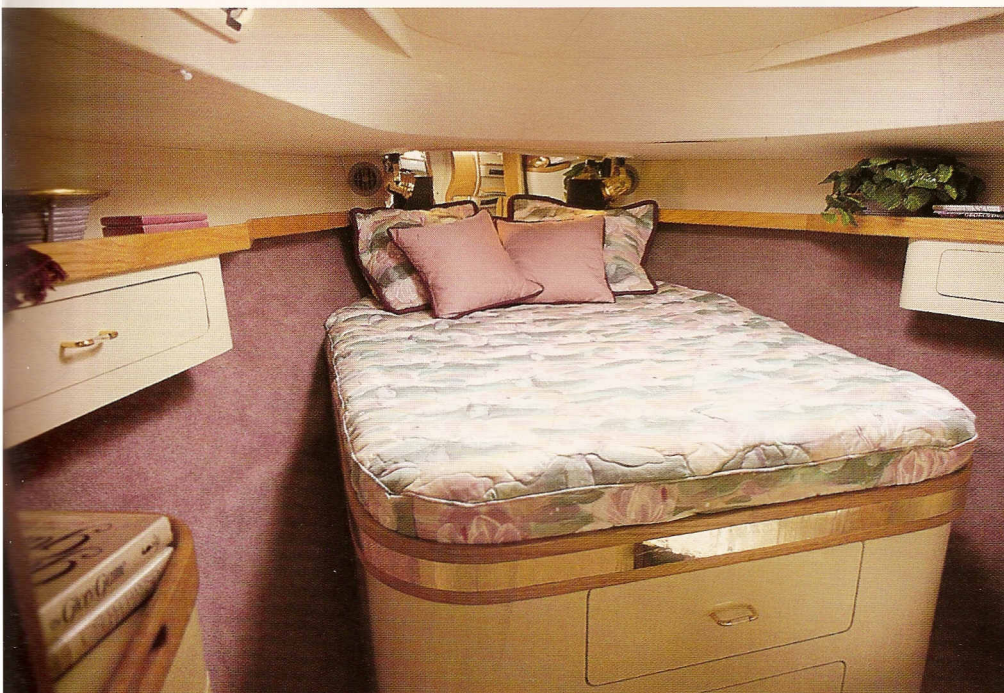
The queen-size island berth in the forward stateroom.